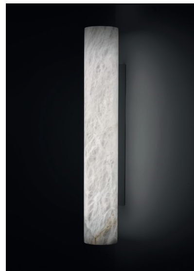
Non contractual picture / Photographie non contractuelle