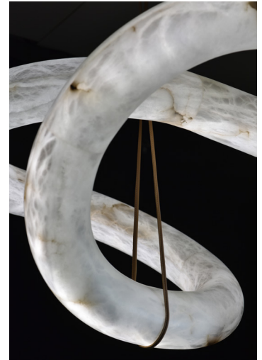
Non contractual picture